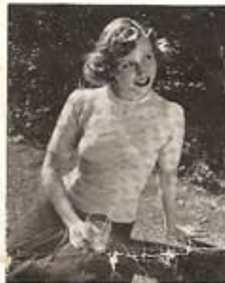
Leaflet No. 6768 Jumper in "Fairytex" Wool