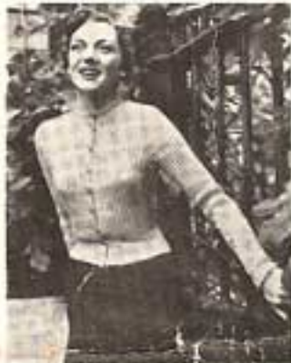
Leaflet No. 6766 Brief Cardigan in Crepe Wool